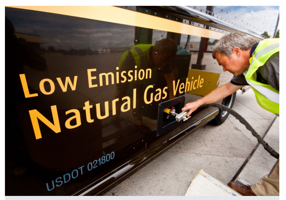
CNG vehicles are fueled with easy-to-use, pressure-sealed fueling connectors.