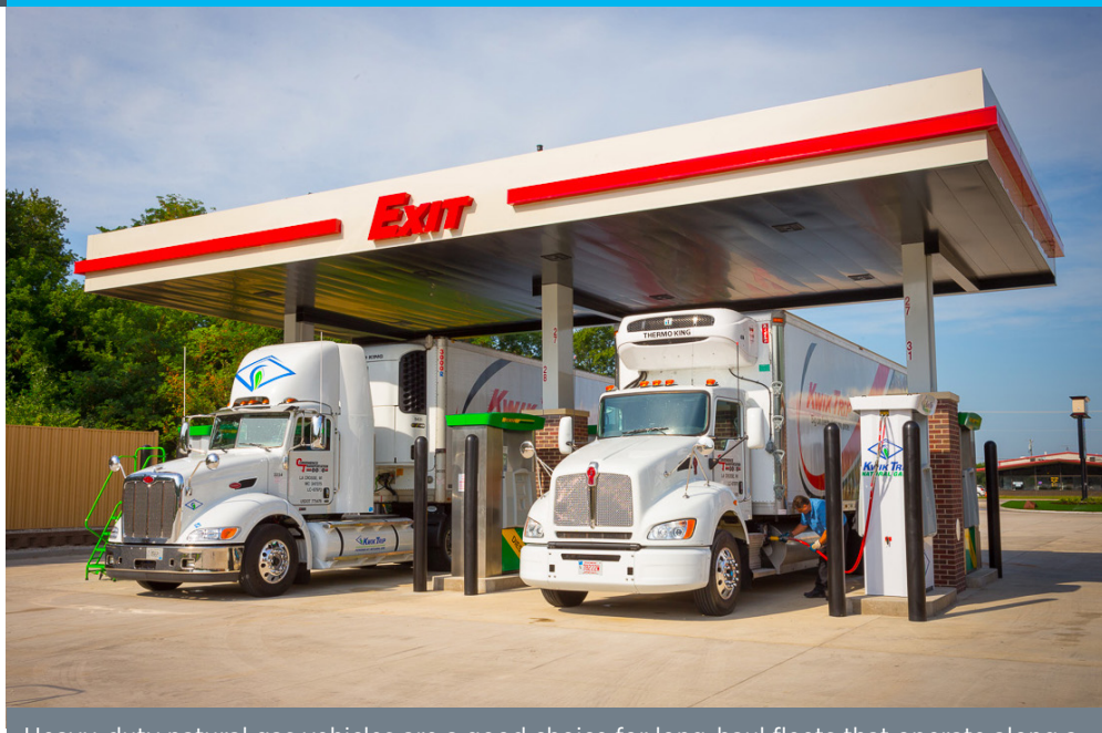
Heavy-duty natural gas vehicles are a good choice for long-haul fleets that operate along a route with natural gas fueling stations.

Liquefied natural gas (LNG) is super-cooled and stored in its liquid form at -260°F in insulated tanks. Because liquid is more dense than gas, more energy can be stored by volume. This makes LNG favorable for trucks that need a longer