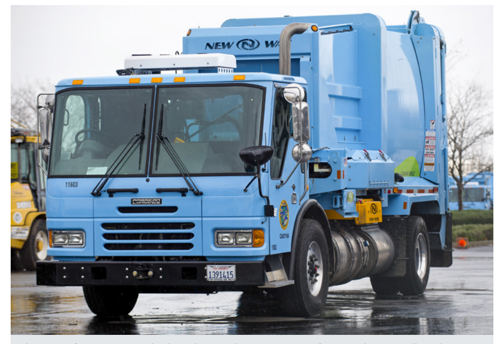
The City of Sacramento deployed more than 100 LNG refuse trucks, as well as the fueling stations and maintenance facilities to support them. The project resulted in millions of dollars saved and more than 1,900 tons of annual greenhouse gas emissions averted. Learn more at afdc.energy.gov/case/1424 .

Locator mobile app from the AFDC website ( afdc.energy.gov/stations ). To obtain the best fuel price at public fueling stations, fleet managers should negotiate competitive pricing. Using stations without such an agreement may result in paying higher prices.